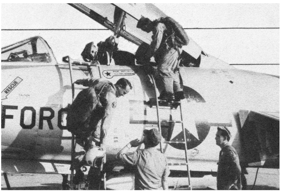
F-101 crew boarding aircraft