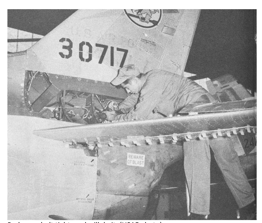
Perhaps a bolt tightened will do it.