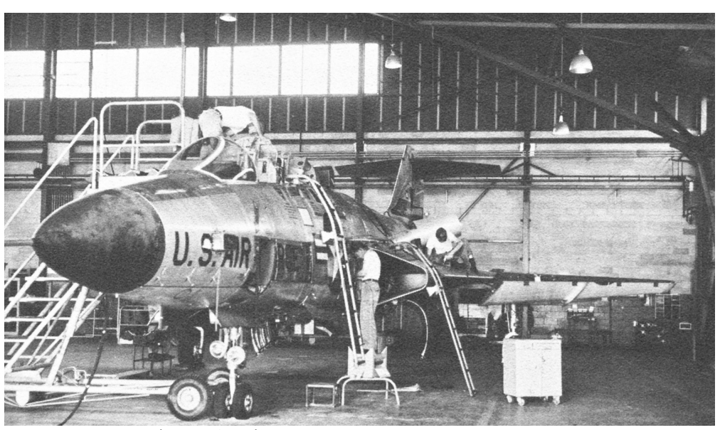
F-101 maintenance