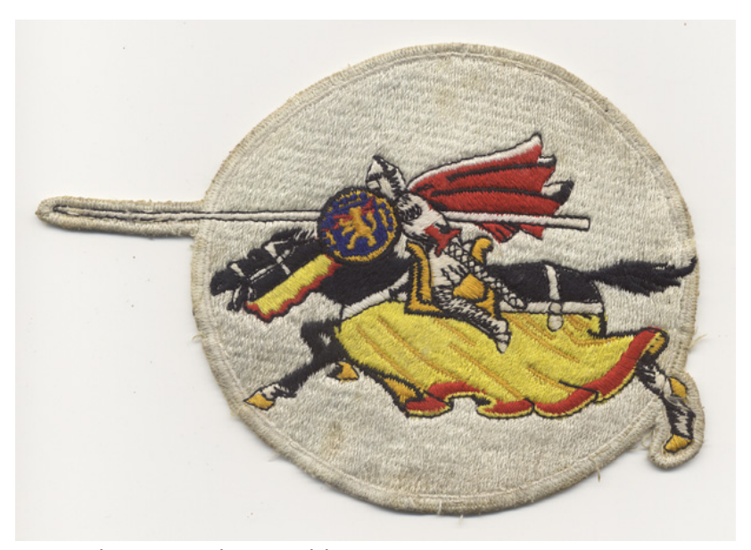
444 Fighter Squadron emblem

444 Fighter Interceptor Squadron emblem: On a disc Air Force yellow, within a double border of the first and black, a gargoyle green, lips and eyes red, pupils, eyeballs and teeth Air Force yellow, perched on a rocket and grasping a lightning bolt in each hand, points downward red, all shaded and outlined of the third. (Approved, 13 Jul 1954)