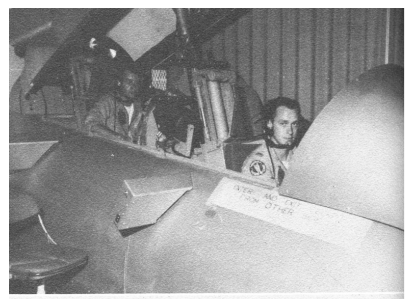
F-101 flight simulator