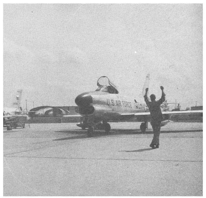
F-86 ready to taxi