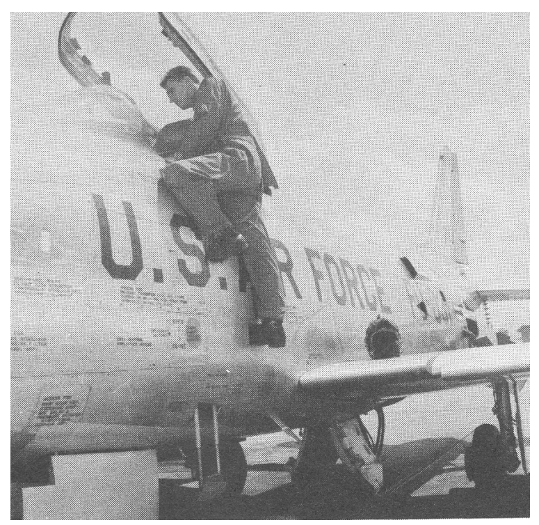
Pilot complete his preflight check