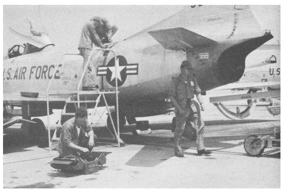
Ground crew swarms over F-86L when trouble develops

Pentagon disputes reports that the plutonium trigger was on the weapon. The B-47 was subsequently scrapped. Sabre pilot ejects safely, and the B-47 crew are uninjured in emergency landing.