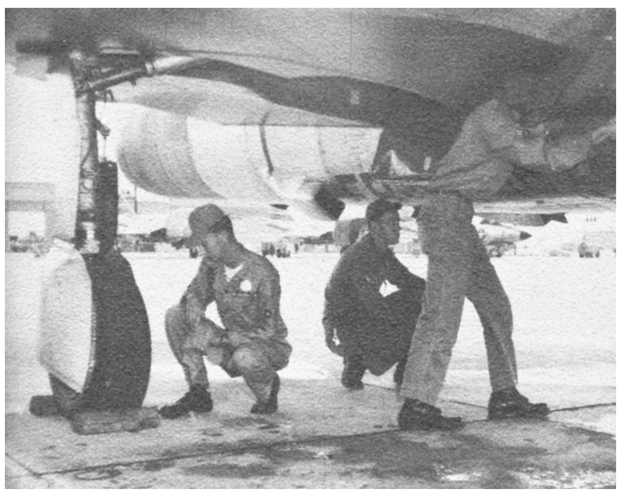
F-101 post flight inspection

Air Force Unit Histories Created: 3 Nov 2011 Updated: 23 Nov 2020